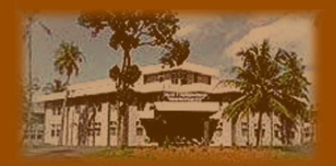
College of Engineering, Perumon