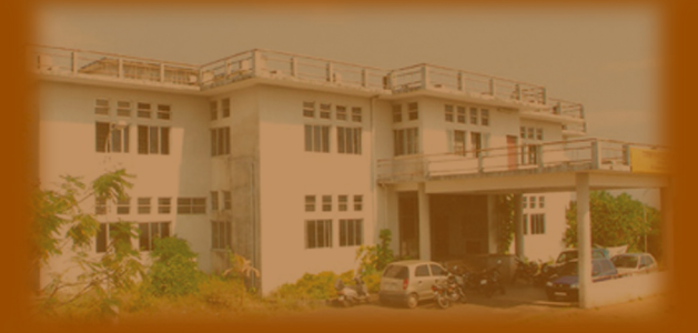
College of Engineering, Vadakara