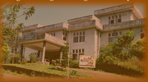
College of Engineering, Kidangoor