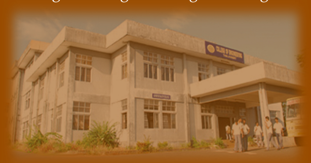
College of Engineering, Thalassery