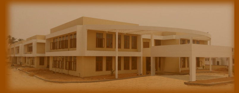
College of Engineering, Muttathara