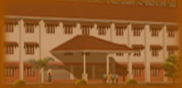
College of Engineering & Management, Punnapra