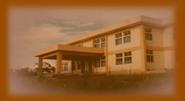
College of Engineering, Trikaripur College of Engineering, Aranmula